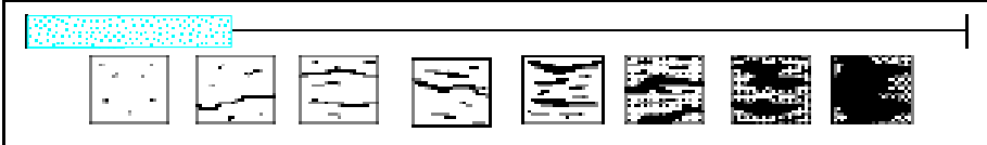
this scale bar shows the meaning of the distribution terms at the current time

An overflight to the south this morning observed bands of emulsified oil no further south than approximately 28° 9' N, with sheens continuing to 27° 32' N – in a narrow band as seen in the satellite imagery. Although recent satellite imagery (from Saturday AM) indicated that the portion of the oil moving to the SE towards the Loop Current (LC) was being entrained into a counter-clockwise rotating eddy to the north of the LC, sheens were no longer visible within the eddy on this morning's overflight. Trajectories for remaining observed oil within this region suggest some of these scattered sheens will continue to be entrained in the counter-clockwise eddy, while a smaller portion may move in to the LC and persist as very widely scattered tarballs not visible from imagery.