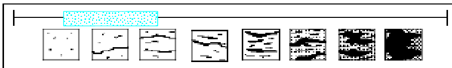
this scale bar shows the meaning of the distribution terms at the current time