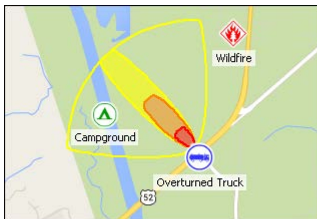
A sample ALOHA threat zone estimate shown on a MARPLOT map (key locations of concern were added in MARPLOT).

ALOHA's threat zones can be displayed on maps in MARPLOT®, another program in the CAMEO suite.